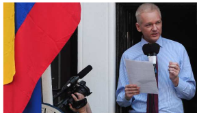
Photos: WikiLeaks founder breaks his silence

The president said Ecuador had sought but did not receive guarantees that Assange would not be extradited to a third country.