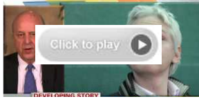
Why did Ecuador grant Assange asylum?