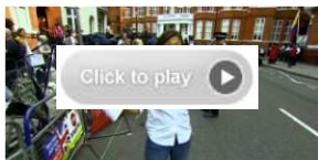
Assange protests in London

Assange, an Australian national, and his supporters claim a U.S. grand jury has been empaneled to consider charges against him. They fear if he is extradited to Sweden, he could be sent next to the United States.