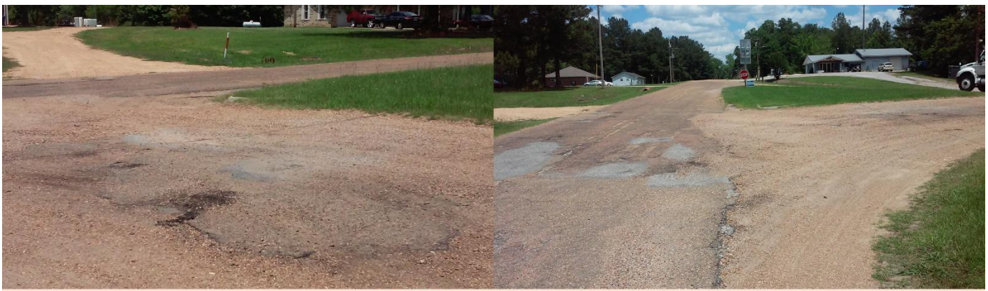
CITY LIMITS Utica, Mississippi (05/2017)