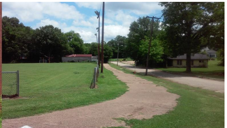
Utica Consolidated High School FOOTBALL & TRACK FIELD (2017)