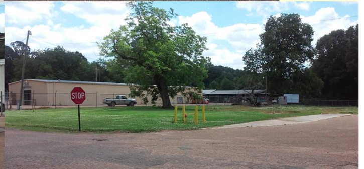
NOW (2017) – HINDS COMMUNITY COLLEGE (Utica Branch)

A WHITE Junior College That UNLAWFULLY/ILLEGALLY Engaged In CRIMES Under The KU KLUX KLAN ACT... To GAIN CONTROL Of A Historical Black College/University (HBCU)