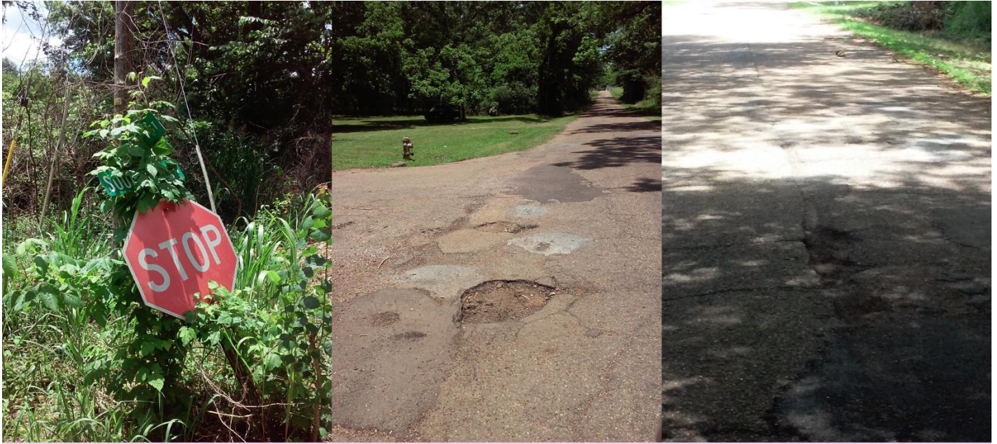
CITY LIMITS UTICA, Mississippi (05/2017)

this meeting as well as from FEEDBACK in the Communities, that WHITES were OBSTRUCTING SUCH PROGRESS! Although the buildings are looking rough, we are looking for IMPROVEMENTS in the appearance of the INFRASTRUCTURE – i.e. taking ONE STEP at a TIME!