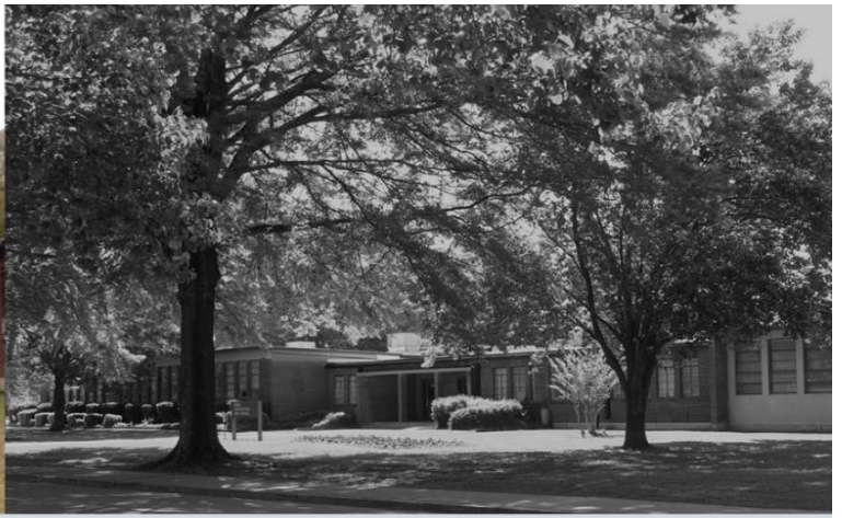
HINDS AGRICULTURAL HIGH SCHOOL (also known as HINDS AHS ) – Utica, Mississippi