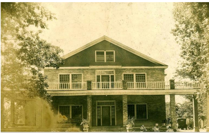
THEN - Holtzclaw Mansion – Utica Junior College (HBCU) A HISTORICAL Landmark DESTROYED by a WHITE Junior College ( Hinds Community College... )