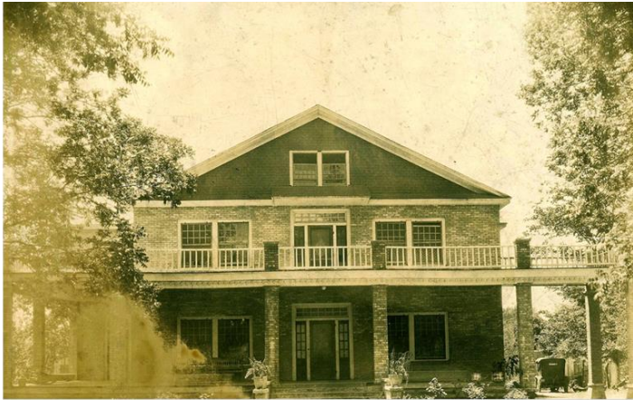
THEN - Holtzclaw Mansion – Utica Junior College (HBCU) A HISTORICAL Landmark DESTROYED by a WHITE Junior College ( Hinds Community College... )