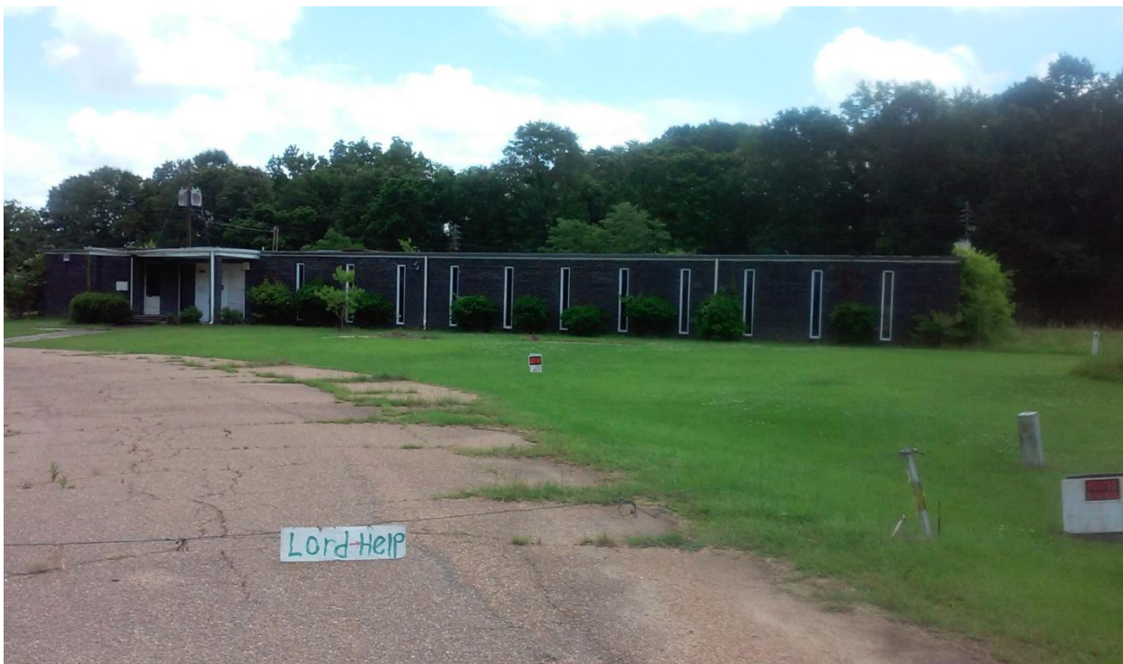
UTICA, Mississippi SEWING FACTORY (2017)

OBJECT OF CONSPIRACIES: To DESTROY the Job Industry and make Blacks/African-Americans/Negroes/People-Of-Color DEPENDENT