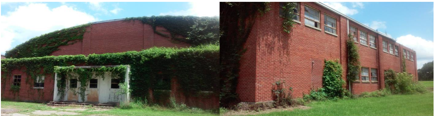
Utica Consolidated High School GYMNASIUM (2017)

RATHER than find ways to UTILIZE this School ONCE it CLOSED , because of CONSPIRACIES to TURN Utica, Mississippi into a PRISON TOWN , the State of Mississippi and Utica's Government Officials ( WHITE Supremacists/Jewish/Zionists CONTROLLED ) merely ALLOWED the Utica Consolidated School to DETERIORATE to such DILAPIDATED conditions!