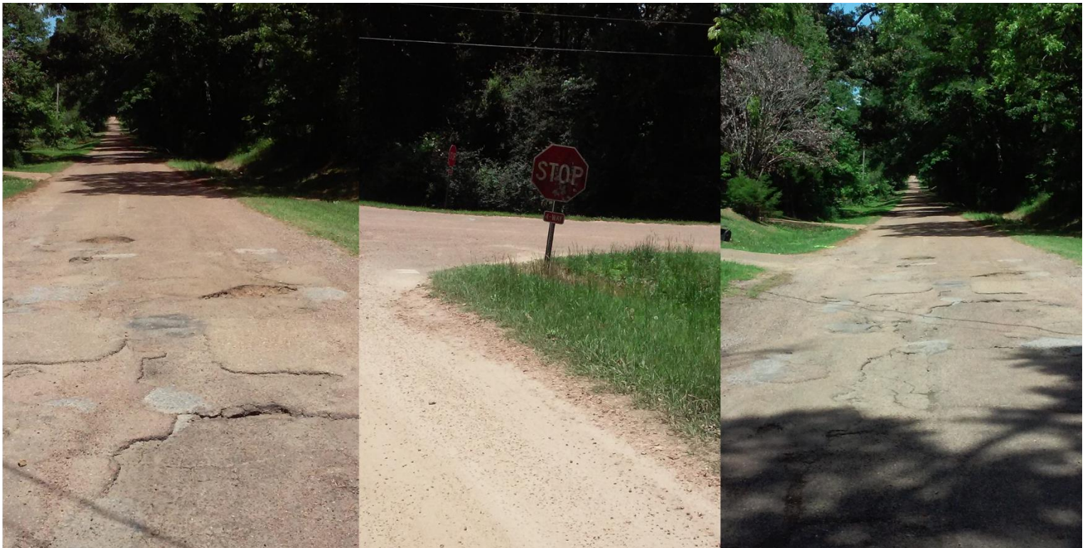
CITY LIMITS Utica, Mississippi (05/2017)

These are Photographs/Images of the CONDITION of the INFRASTRUCTURE on the Streets/Roads in Utica, Mississippi!