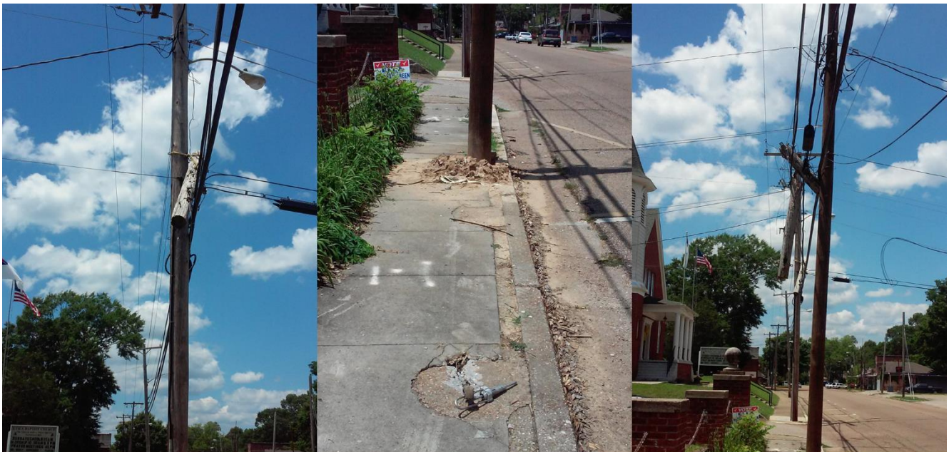
Downtown UTICA, Mississippi (05/2017)