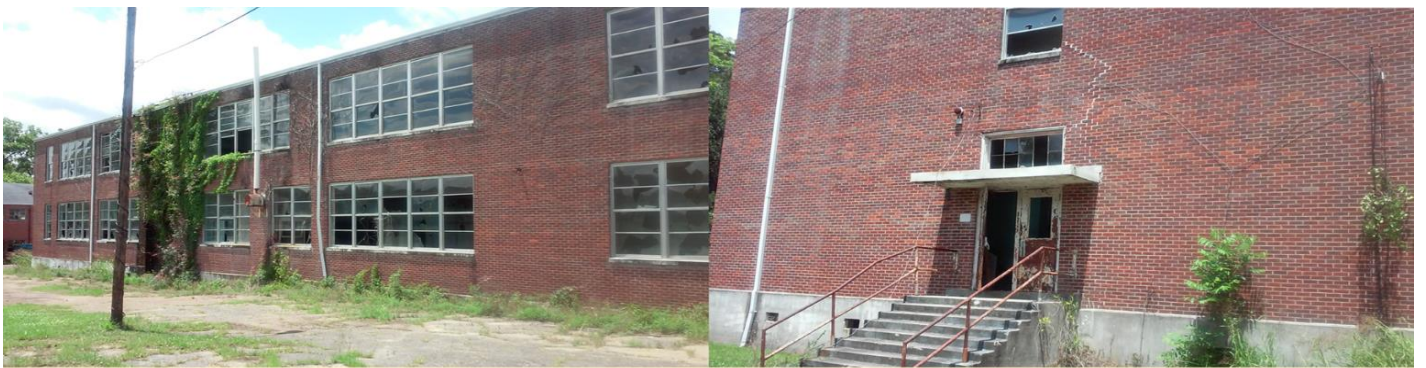
Utica Consolidated High School (2017)