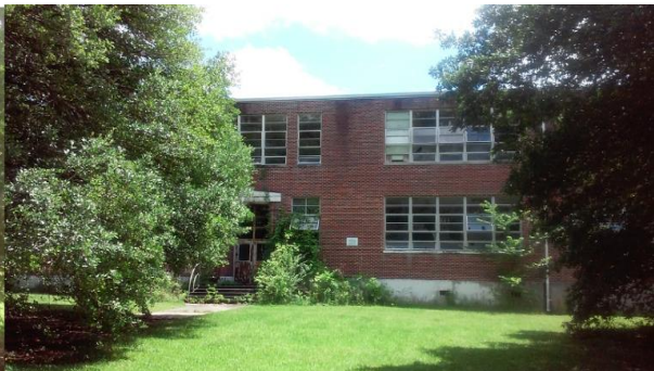
Utica Consolidated High School (2017)