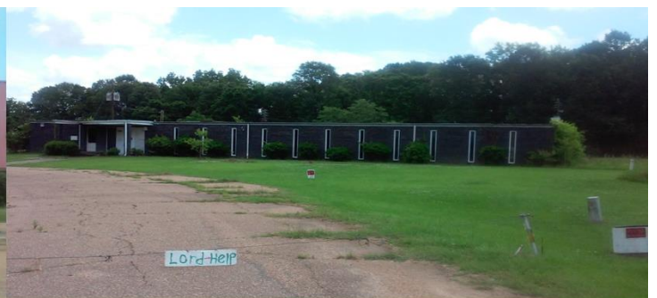
CITY LIMITS UTICA, Mississippi (05/2017) - Businesses That FAILED as a RESULT of the WHITE SUPREMACISTS Conspiracies