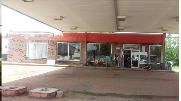
CITY LIMITS UTICA, Mississippi (05/2017) - Businesses STRUGGLING To Survive AMONG Those That FAILED!