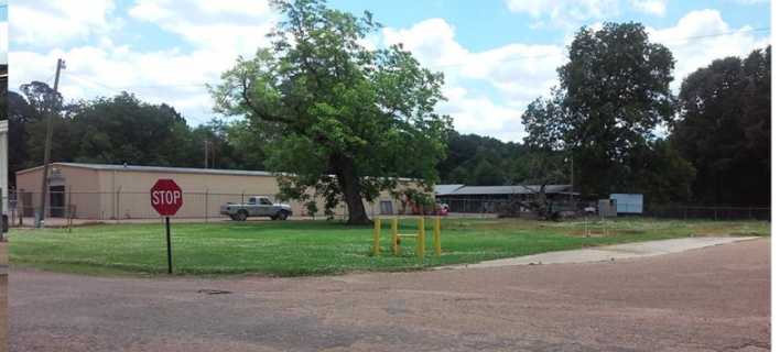
NOW (2017) – HINDS COMMUNITY COLLEGE (Utica Branch) A WHITE Junior College That UNLAWFULLY/ILLEGALLY Engaged In CRIMES Under The KU KLUX KLAN ACT... To GAIN CONTROL Of A Historical Black College/University (HBCU) For Purposes Of Acquiring Land/Properties To Build A PRIVATE Prison For Blacks/African-Americans/Negroes/People-Of-Color

For instance, WRITING Legislation/Laws to ADVERSELY IMPACT Schools affecting: (a) FUNDING; (b) RE-Districting; (c) Enrollment, etc. for the purposes of SHUTTING Down Schools with a HIGH Enrollment of Blacks/African-Americans/Negroes/People-Of-Color and BUILDING UP WHITE Schools! For instance, in Utica, Mississippi there were TWO High Schools at one time known as: