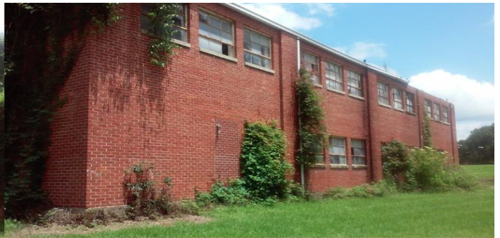
Utica Consolidated High School GYMNASIUM (2017)