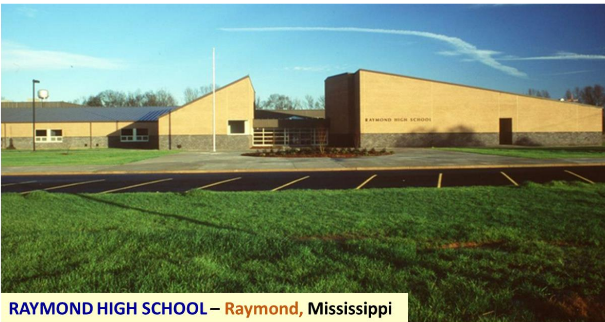
RAYMOND HIGH SCHOOL – Raymond, Mississippi

In efforts of AVOIDING DETECTION and efforts of EVADING Statutes/Laws as the KU KLUX KLAN ACT , White Supremacist Groups as the Ku Klux Klan and its Law Firm of Baker Donelson Bearman Caldwell & Berkowitz have POSITIONED themselves in STATE and FEDERAL Governments as the LEGISLATIVE Branch for the purpose of WRITING Laws ; EXECUTIVE Branch for the purposes of SIGNING Legislation INTO LAW ; and JUDICIAL Branch to ENFORCE. . .!