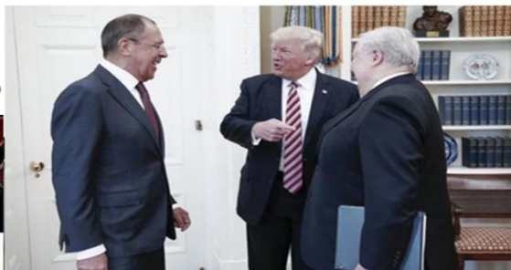
Donald Trump meets Russia's Foreign Minister Sergei Lavrov, left, and Russian Ambassador Sergei Kislyak.