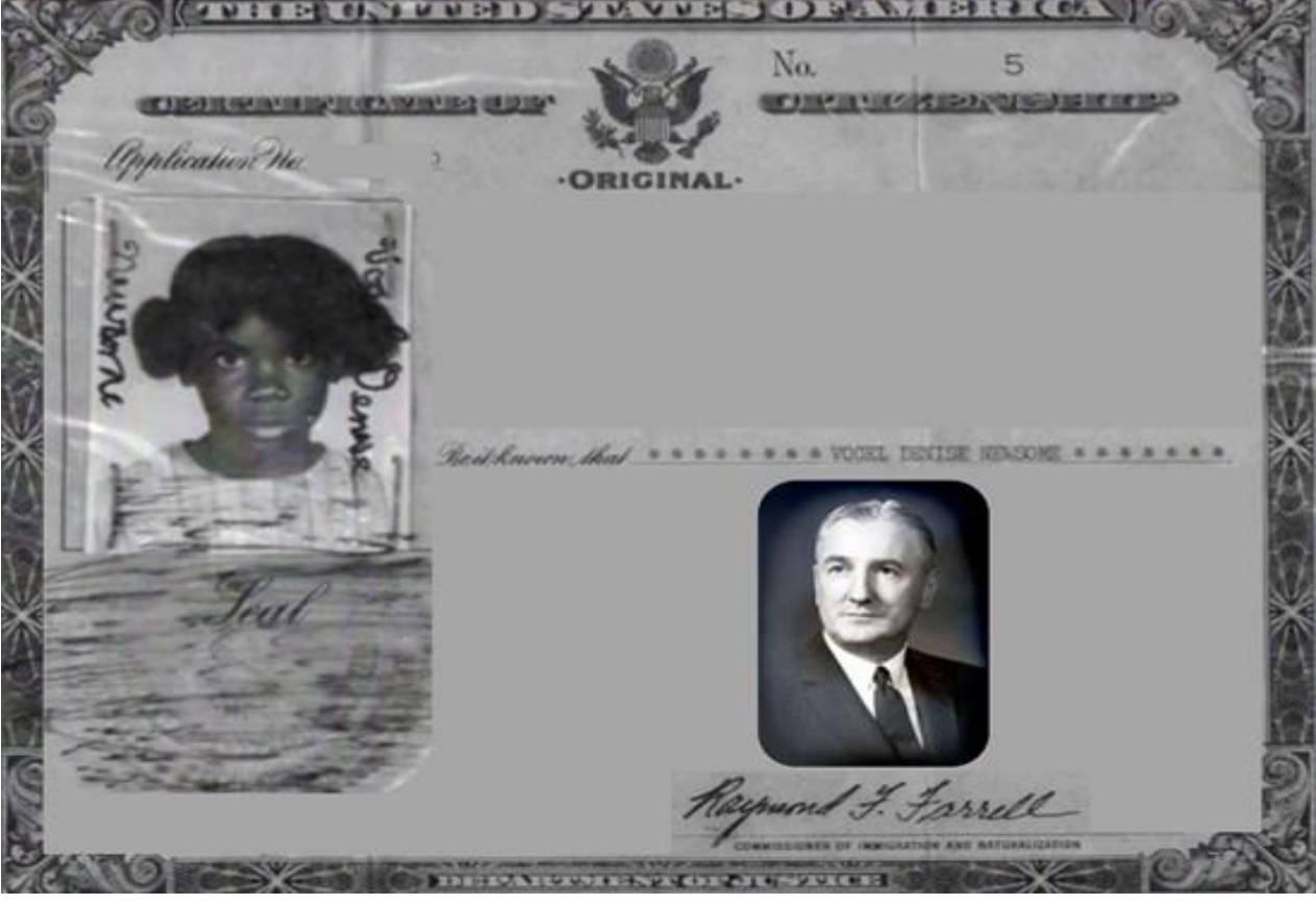
USING THE LAWS TO BRING THE UNITED STATES OF AMERICA'S NAZIS and ZIONISTS... TO JUSTICE