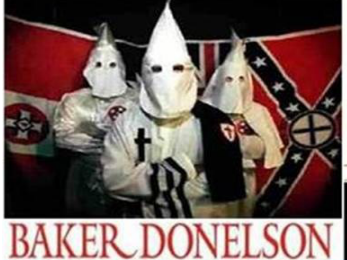
17 USC § 107 (LIMITATIONS On EXCLUSIVE Rights - FAIR USE)