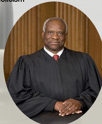
Clarence Thomas – Roman Catholicism