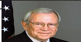
Howard Baker Former Chief of Staff to U.S. President/Senior Counsel – Baker Donelson

U. S. District Court Eastern District of Louisiana (New Orleans) CIVIL DOCKET FOR CASE #: 2:99-cv-03109-GTP