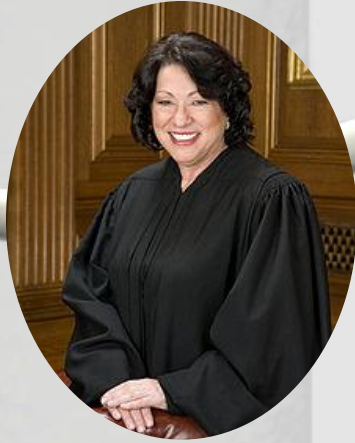
Sonia Sotomayer – Roman Catholicism