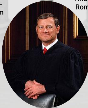
Chief Justice John G. Roberts – Roman Catholicism