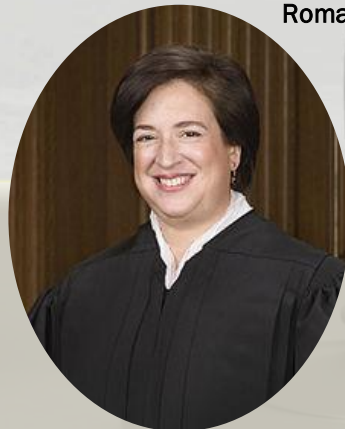
Elena Kagan – Conservative Judaism