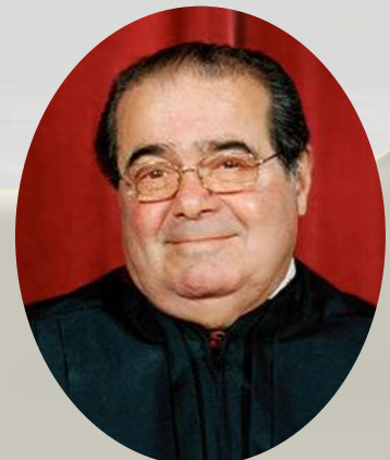
Antonin Scalia – Traditionalist Catholic