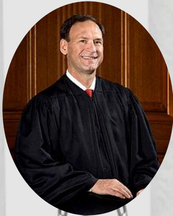
Samuel A. Alito – Roman Catholicism