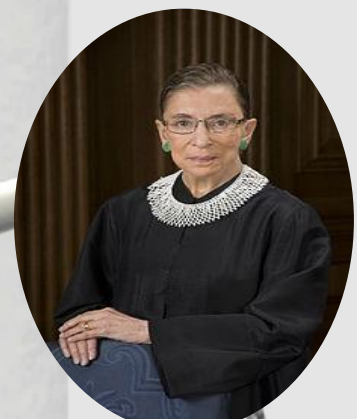
Ruth Bader Ginsburg – Judaism