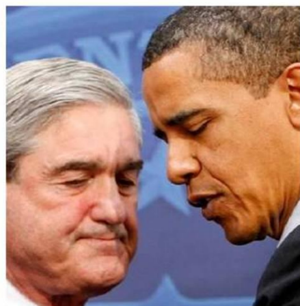
FBI Director Robert Mueller & U.S. President Barack Obama

SENIOR Counsel/CHIEF OF STAFF to Federal Bureau of Investigation Director Robert Mueller Assistant Attorney General for Office of Legislative Affairs. Administrative Assistant/Legislative Director for Senator Pete V. Domenici. Staff Member for the Senate Committee on Environment and Public Works. Legislative Specialist Office of Legislation and Subcommittee Director for Senator Howard H. Baker for the Environmental Protection Agency. Chief of Staff for Senator William "Bill" Frist. MANAGING PARTNER - Baker Donelson Bearman Caldwell & Berkowitz.