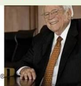
Howard Baker, Jr.