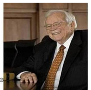
Howard Baker, Jr.